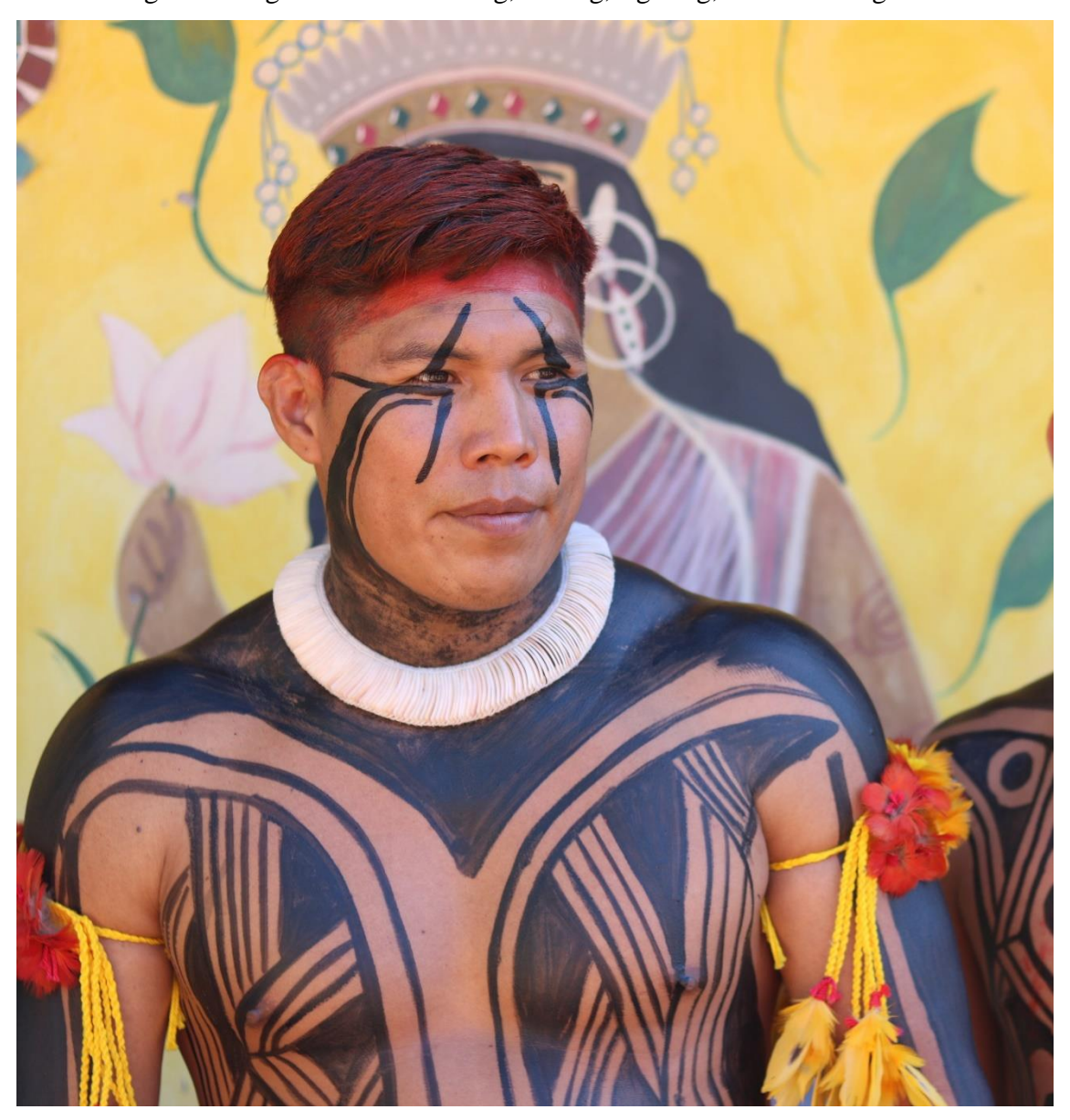
A member of the Mehinako people [1] decorated and painted with the colors of the rainforest fruits annatto (red) and jenipapo (black). On ordinary days, the painting is simple, while on festivals, in battle, and in traditional rituals, it is particularly exquisite.

They paint their bodies and faces to protect themselves from bad energies and to defend themselves against evil spirits. The colors and traditional patterns send messages and are said to guarantee good luck in hunting, fishing, fighting, and travelling.