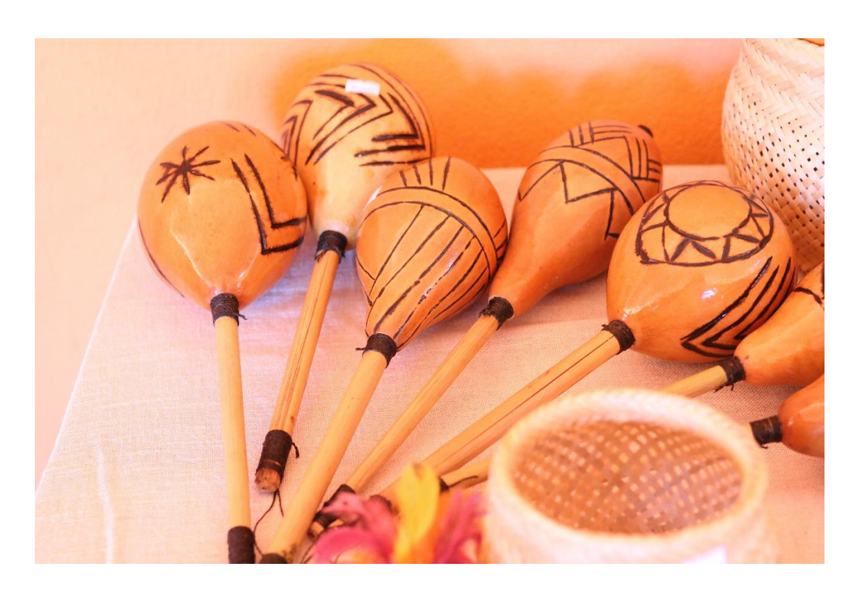
Traditional musical instruments such as the maraca rattle are also decorated with the characteristic designs. In addition to preserving the tradition, the handicrafts are sold to tourists and are therefore of great importance as a source of income for the indigenous population.