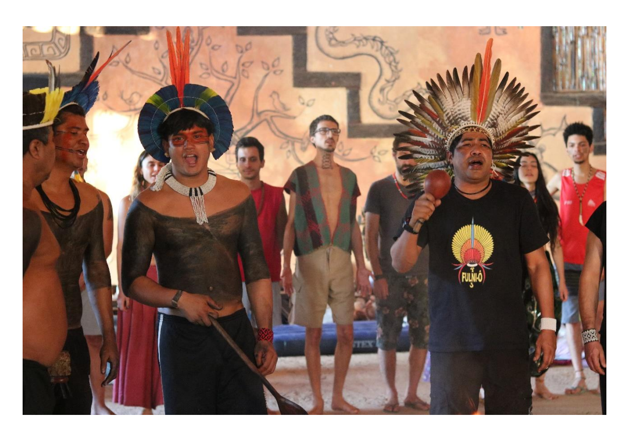
Representatives of the Fulni-ô people singing and making music at the closing ritual.

The festival draws to its end and visitors gather for a grand closing ritual. There is music and singing and we all dance brightly painted and adorned together into the dawn. So we celebrate once again the indigenous artists, for whom their art is a constant ritual, because it is the art that makes the present to a myth, develops it further and inscribes it in the living body of their people.