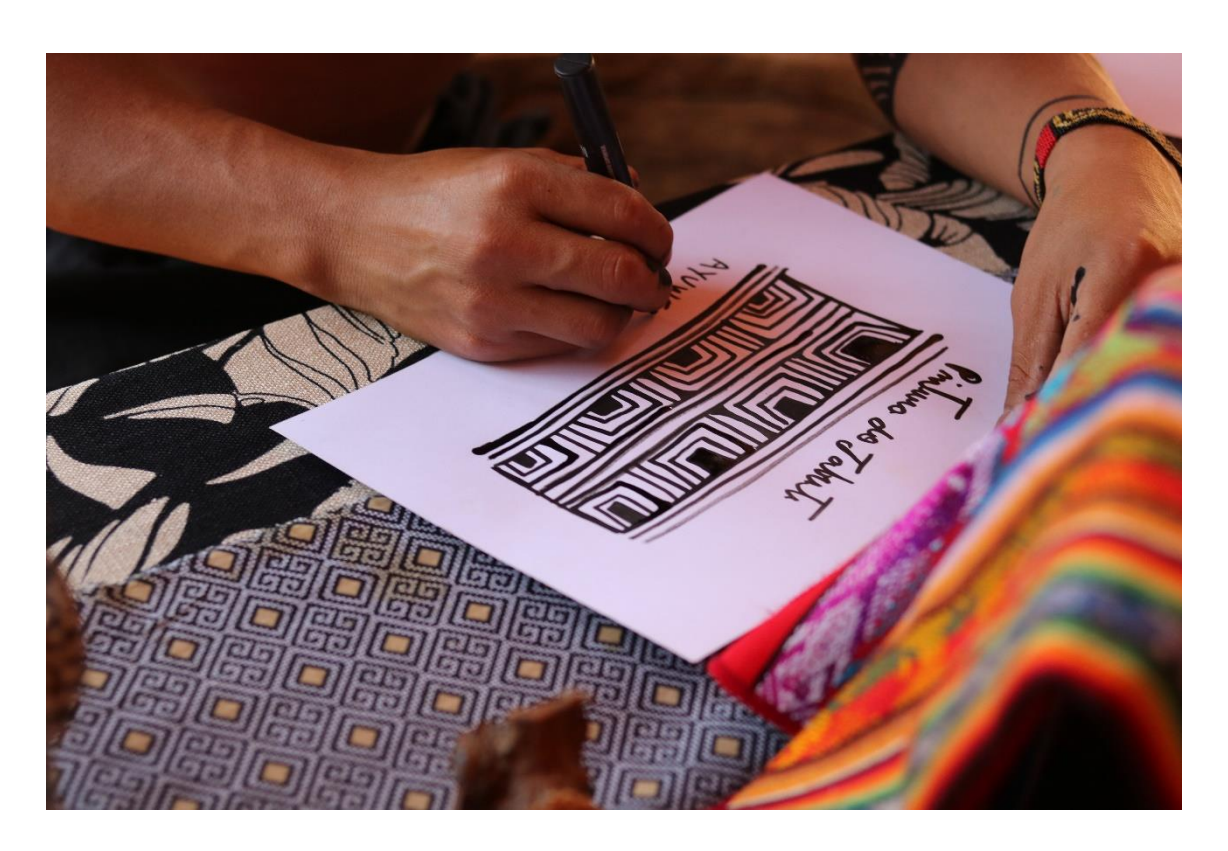
"Pintura do Jabuti" ("Painting of Jabuti").

"Look here," he says, showing me another design of his people. "This graphic has a very special meaning for our people. We call it the "fish graphic" ("Grafismo de Peixe"). It represents a fish called "Kulupeiyna". The Kulupeiyna fish is a very special fish for us that brings harmony, joy and peace out of the water. As that graphic is transferred to the skin, so is the spirit of this fish," he explains.