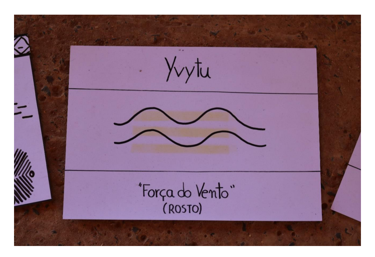
"Power of the Wind" graphic.

But not only the human body is decorated with traditional graphics, also the body of objects such as ceramics, musical instruments, or fabrics. This creates a lively exchange between these different bodies, which represents a cosmos in which everything is connected.